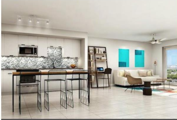
Avery Pompano Beach pool rendering