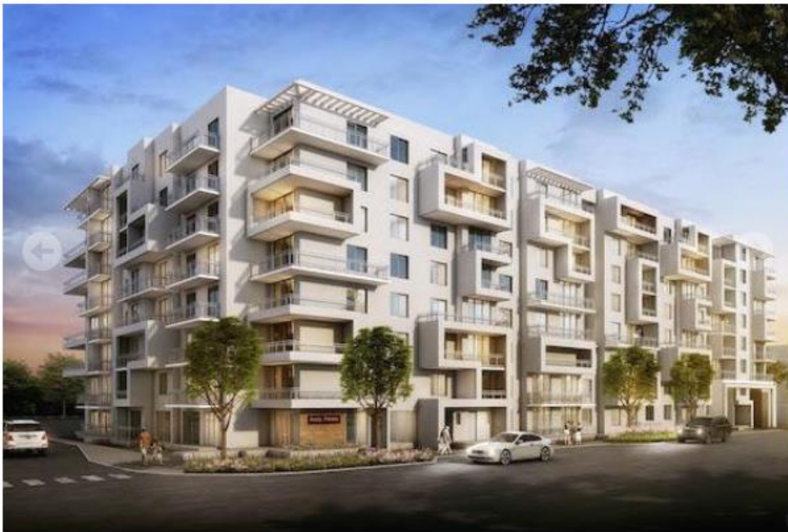
Avery Pompano Beach exterior rendering

By Amanda Rabines | October 29, 2018 04:30PM